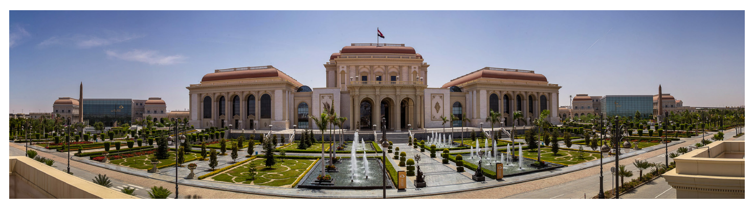
Arts and Culture City in the Administrative Capital

This adds to a number of auxiliary buildings (administration, mosque, restaurants, and the pedestrian bridge connecting the City with Al-Masa Capital project); and a number of electromechanical services' buildings (power plants, chillers, pump rooms, and others).