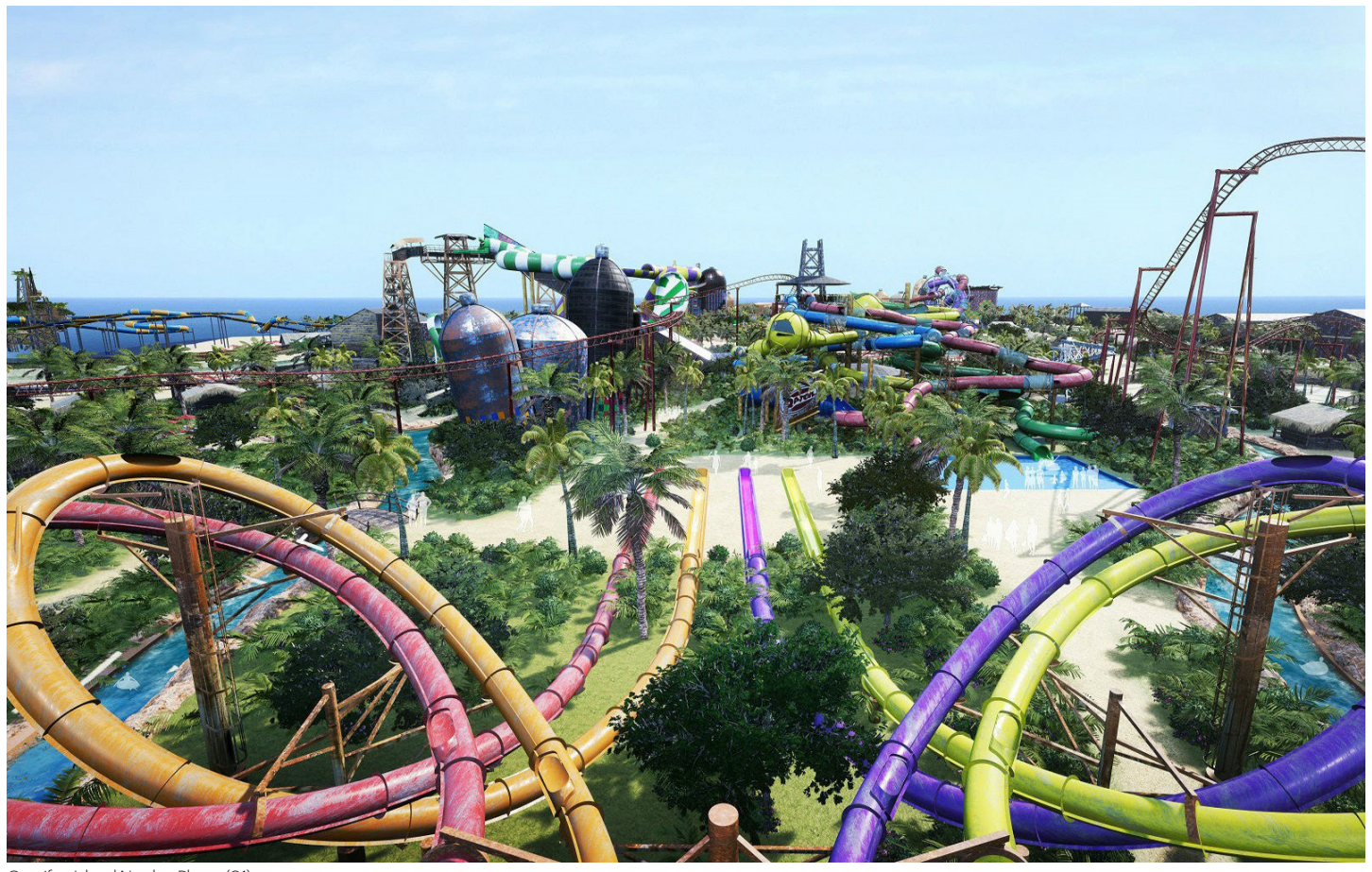
Qetaifan Island North - Phase (01)