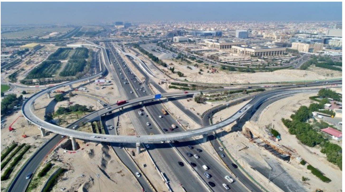
Three Troughs Base Slabs, Two Pedestrian Bridges and Temporary Steel Bridge of RA/256 near Jaber Al-Ahmad Al-Sabah Hospital, South Al-Sura Area

Works covers analysis of the piles required for the five bridges and four utility bridges.