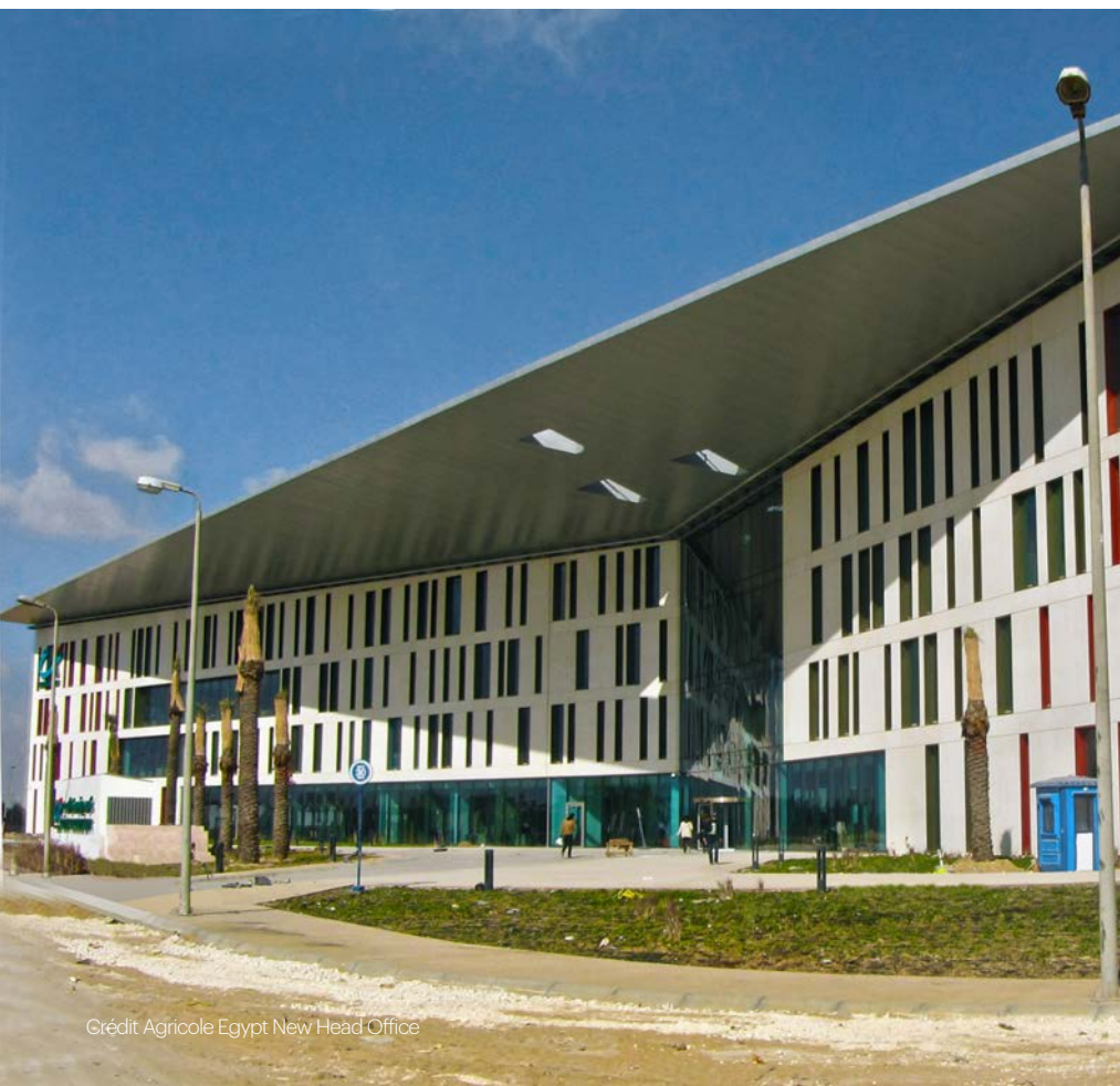
Crédit Agricole Egypt New Head Office